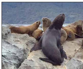
Sea Lions in Ushuaia, Argentina