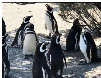
Magellan penguins in Patagonia.